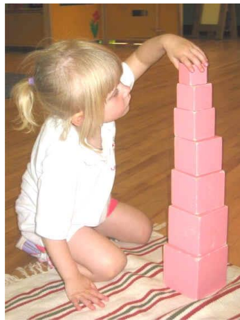
The Pink Tower – simple, engaging, favorite!